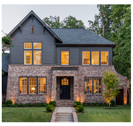
HOY: Midtown Modern Tudor

Galt Commons Garden Hamlet, Kennesaw, Ga.